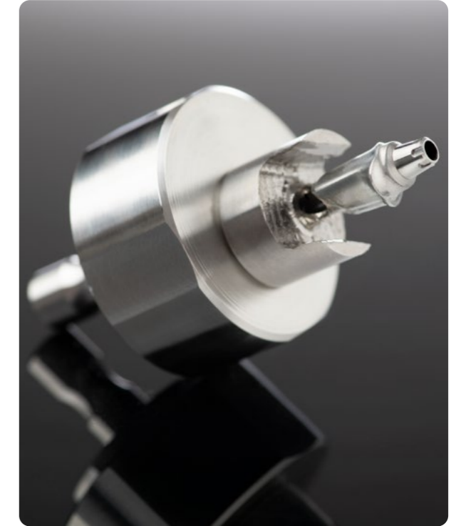
vhf also offers an impressive selection of abutment holders for all common systems.

* Material and indication availability may vary by CAD provider. Full range of indications and materials available in STL workflow.